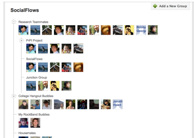
Figure 1. Our social topology browser, showing social groups automatically mined from e-mail data. Individuals can be members of multiple groups; subgroups within groups are nested hierarchically.

IUI 2011, February 13–16, 2011, Palo Alto, California, USA. Copyright 2011 ACM 978-1-4503-0419-1/11/02...$10.00.